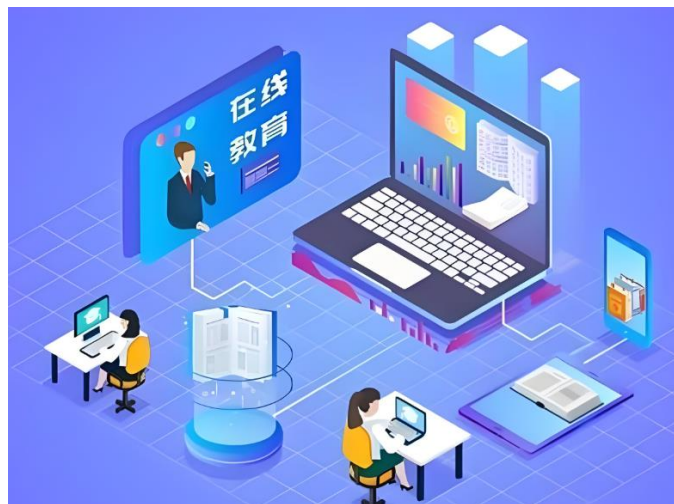
Figure1. Digitization of online education

In terms of hardware coverage, the Ministry of Education released the 2023 National Education Development Statistics Bulletin, which shows that the Internet access rate of primary and secondary schools in rural areas in China has reached 99.7%, and the multimedia classroom coverage rate has exceeded 95% [6]. Under the leadership of the government, the construction of rural education hardware facilities continues to promote, such as the "comprehensive thin" project has invested a total of more than 200 billion yuan, focusing on improving the basic operating conditions of rural schools. At the same time, enterprises and social forces are also actively involved, Ten-cent "for the village plan" and the cooperation of the government in many places, donating intelligent teaching equipment, help rural schools hardware upgrade; Ali baba "rural education empowerment program" for remote areas of the school donated tablet computers, electronic whiteboards and other equipment to promote the balanced allocation of educational resources, and is expected to achieve a digital environment for online education as shown in Figure 1.