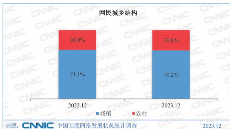
Figure2. Urban-rural structure of Internet users

As of December 2023, China's Internet penetration rate in urban areas was 83.3%, up 0.2 percentage points from December 2022; the Internet penetration rate in rural areas was 66.5%, up 4.6 percentage points from December 2022, as shown in Figure 3.